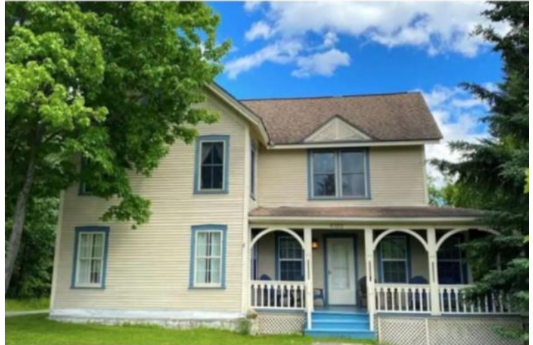
Miracle Hill Lodge, Lake Placid Village, NY

Lodging for this trip will be Miracle Hill Lodge, a vacation rental home