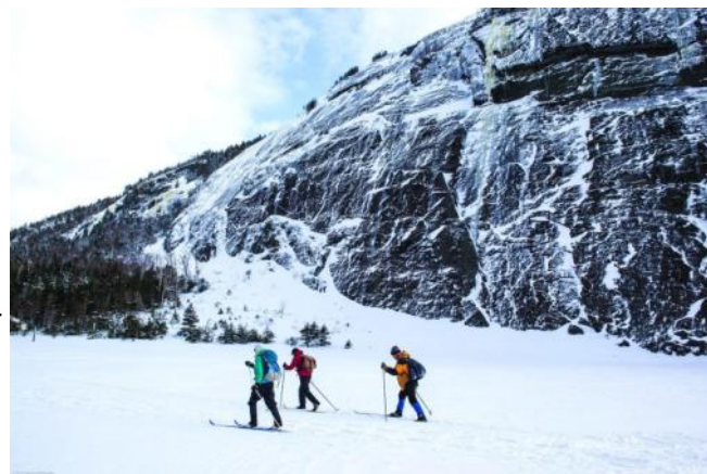
Backcountry skiing at Avalanche Pass near Adirondack Loj

Whale Tail Tour. Novice to intermediate. Shorter tour. From ADK prop-