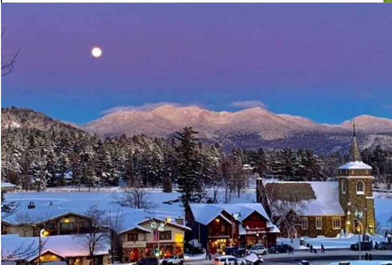
Lake Placid Village, NY, in winter

Driving time is 8 hours, 501 miles from DC via I-95, I-87, 9 hours, 546 miles from DC via I-81, I-88, I-87. Typical flights are, from BWI Southwest nonstop 1 h 15 min from $255, from DCA American nonstop 1 h 18 min from $271. You could take Amtrack from Union Station, DC 15 h 38 min from $92 (to Port Henry, NY) or bus from Union Station, DC 10 h 50 min from $60 (to Albany, NY). You would need rent a winter-worthy car if you took public transportation.