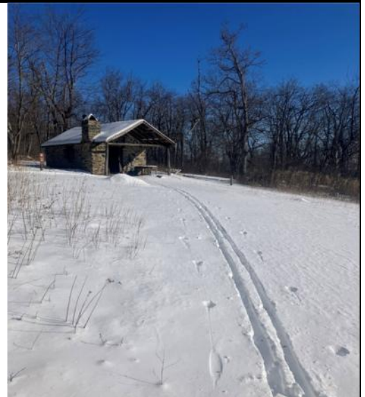
Range View Cabin the winter of 2024

You may be wondering about the TBD trip listed in this season's lineup. Shenandoah National Park (SNP) is seldom visited in the winter by the ski club. However, this national park is nearby and often has several days of snowfall sufficient for backcountry skiing. The natural beauty and solitude during the winter months are lovely, even magical, especially when the trees are all coated in white. I have made numerous winter PATC cabin camping trips over the years whenever there's at least 4 inches of new snow. Because of the extreme conditions this trip is for experienced backcountry skiers. The trailheads can be difficult to reach, and darkness comes early. The cabins in the park are not winterized. The ski in is uphill and long since the Parkway is closed. Each skier will need to pack in the food, sleeping bag and clothing required to deal with the elements. X/C skis with metal edges are recommended. The size of the group is limited because it's determined by the capacity of the cabin we end up renting. When and if a trip is scheduled the trip coordinator will send out a post on Groups i.o to our club members with more details including shared costs. Harrison Snow, trip coordinator, teambuilder@msn.com